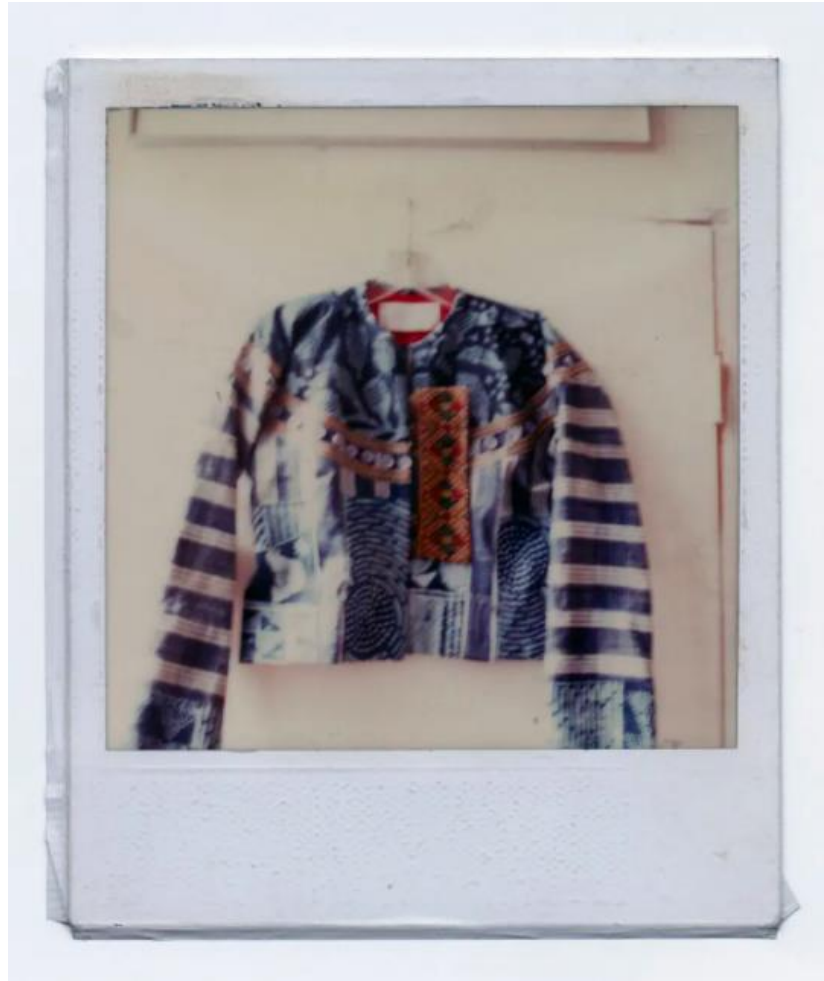
A Knobkerry garment identified as “Chinese aboriginal style of African woven & batik [sic],” 1979.