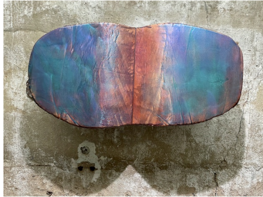
Liz Larner, Inflexion, 2013, ceramic, epoxy and pigment

figurative and abstract, Larner's work is grounded in touch, fluidity, and change. As I progress through the show, I become more and more mindful of the entire space itself, the objects, my body, and the flowing relationship between these entities. The surfaces of the building, like a ghost with unfinished business, keep returning and communicating with the objects and me.