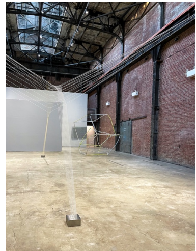
Liz Larner, Bird in Space, 1989, nylon cord, silk thread, stainless steel