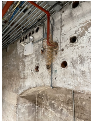
Liz Larner, Guest, 2005, silver plated stainless steel

After discovering "Guest" in an overlooked nook, my senses become hyperaware as I meander down the hall under a low vaulted ceiling. Small vestibules house ceramic pieces between each arch. Here, the works feel raw, each stretched into a slab and hung on the wall, highlighting similarities between the cracks on the concrete wall and the cracks in the pieces. Both mark time and the artist/fabricator's hand. Near the end of the hall, "inflexion" (2013) is covered with iridescent pigments, resembling a euphoria beetle. Its title references a point of no curvature in a fold, and the form has a smooth surface with a wave in its center. Its colors morph from a bluish-purple haze to a rich burnt sienna, alluding to rock formations like the Grand Canyon. Clay, a material born of the land, transforms from wet, soft, and moldable mud into a hard fired object. Larner's ceramic pieces allude to grander and longer processes of change as the Earth churns and morphs slowly.