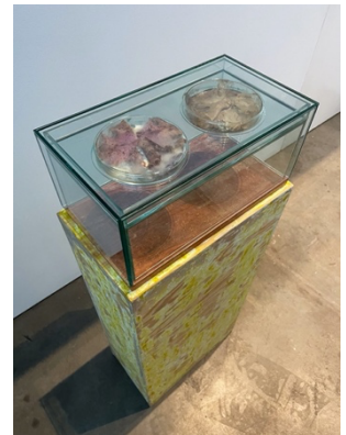
Liz Larner: Don’t Put it Back like it Was, 2022, at SculptureCenter