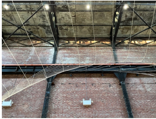
Liz Larner, Bird in Space, 1989, nylon cord, silk thread, stainless steel

I pass through another corridor, which is empty of artworks and stripped bare of electrical equipment except for the ceramic insulations that had been left as a memento. I find a small bronze cast sculpture of a woman running in a flowing dress placed on a concrete wall textured with aggregate. The sculpture's surface is patinated a perfect light green. Titled "You might have to live like a refugee," the sculpture exists on a wall lush with history, accentuating the building's past as a repair shop.