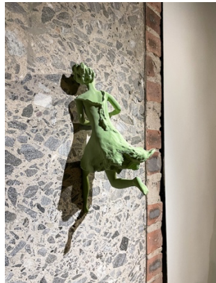
Liz Larner, You might have to live like a refugee, 2019, patinated bronze

As I stand in awe of the beauty of decomposing mold, I’m jarred by a loud bang that shocks me and shakes the walls. Someone else is wreaking havoc with “Corner Basher,” again threatening to break the white cube.